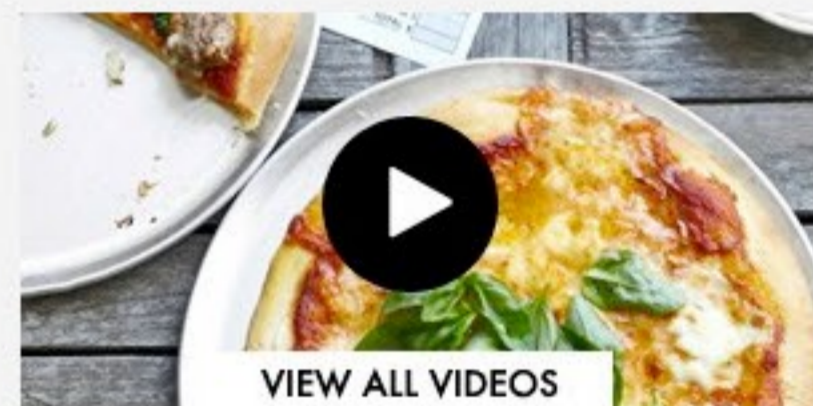
VIEW ALL VIDEOS