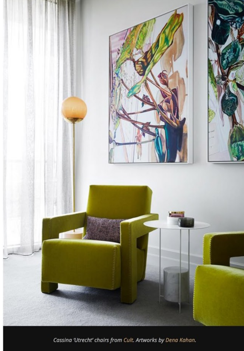
Cassina 'Utrecht' chairs from Cult. Artworks by Dena Kahan.

To create a larger area to cater for a growing extended family, we reconfigured the zone between the dining room and main bedroom to give extra amenity and storage. A custom table now seats 10 in the dining area. We also looked to maximise the exceptional views.