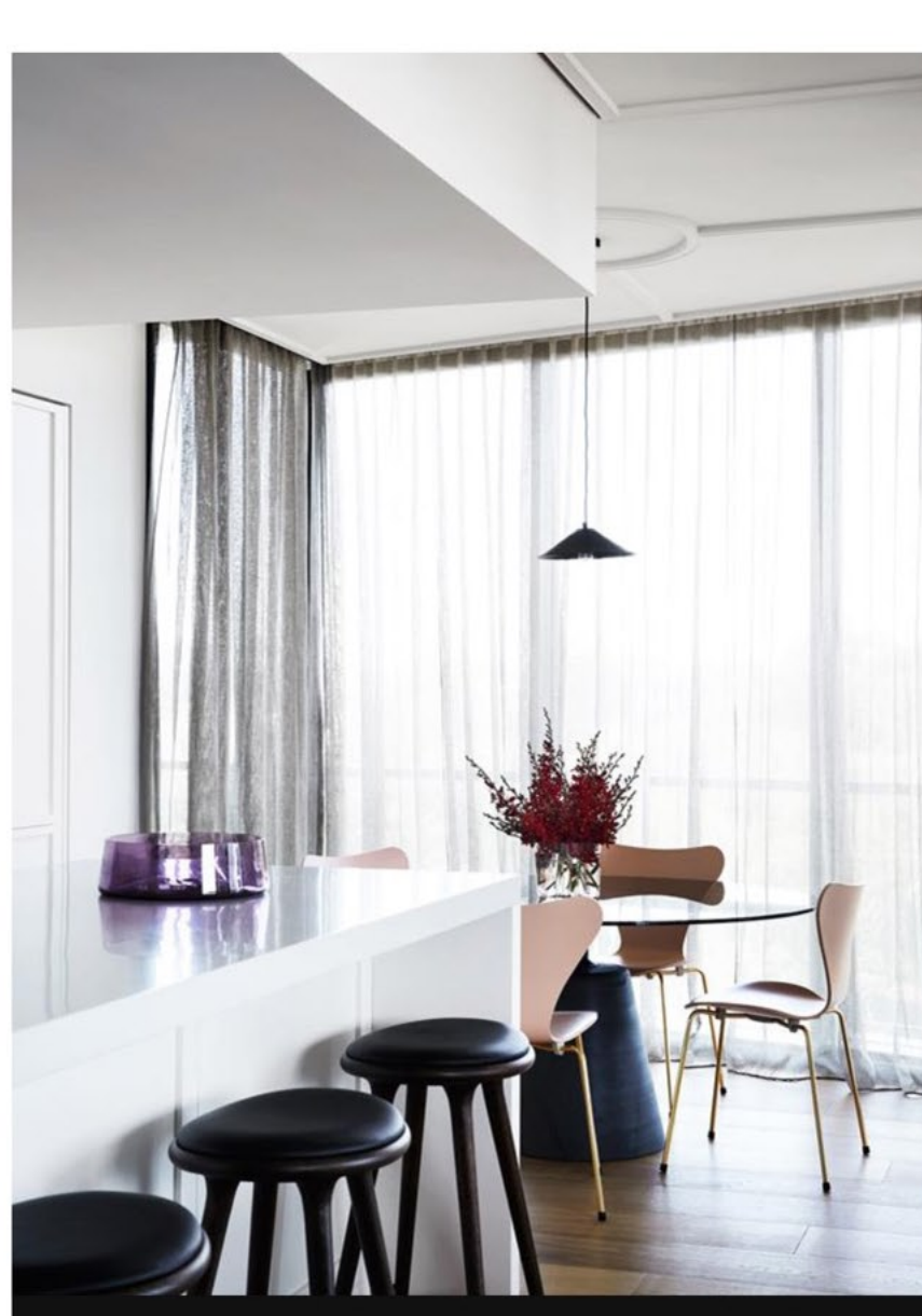
Mater stools from Cult. 'Rock' table from Hub. 'Triangle' light by Douglas & Bec.

The bespoke American oak table inlaid with pink-veined green marble with a brass trim and 'socks' on the table legs.