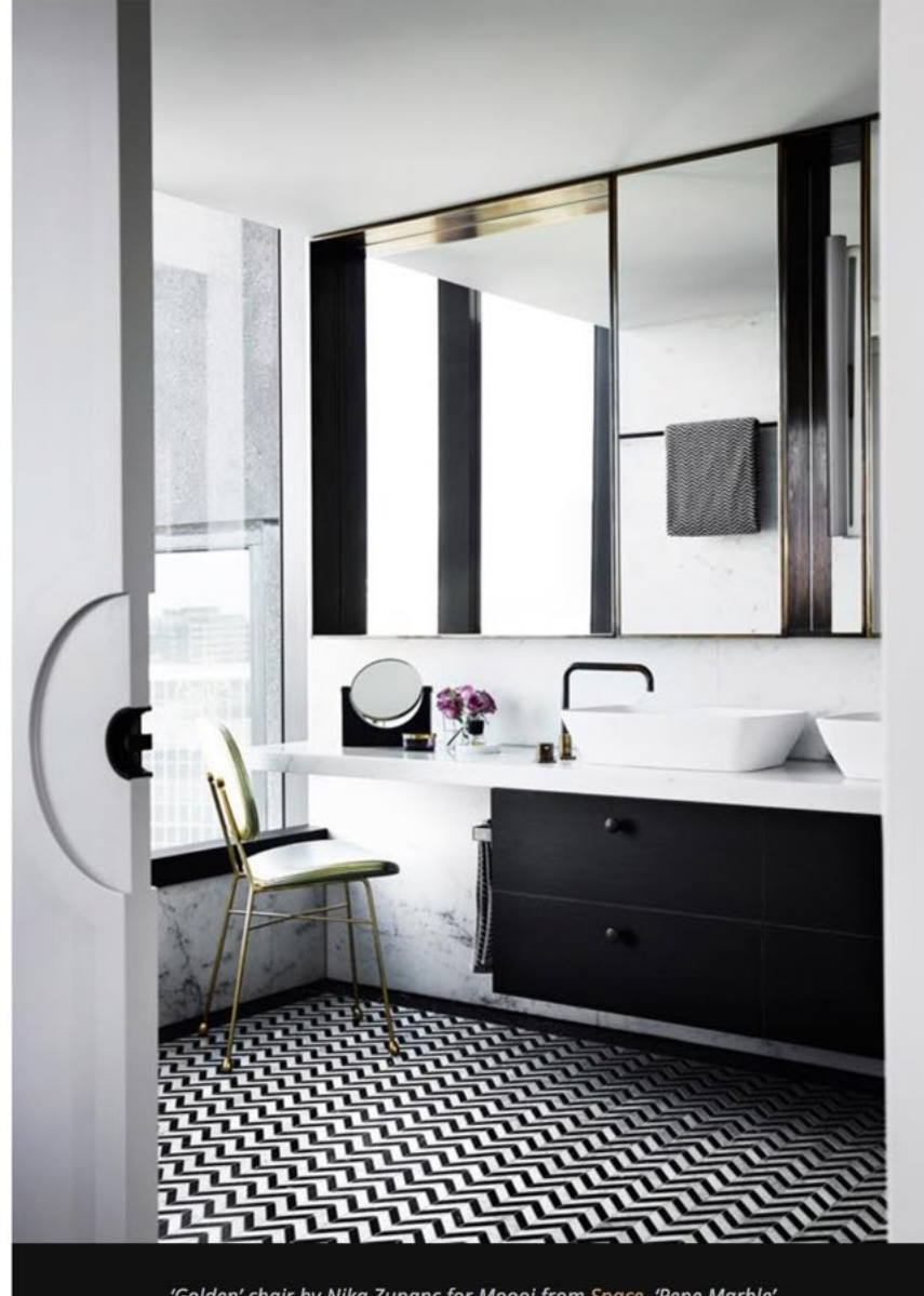
'Golden' chair by Nika Zupanc for Moooi from Space. 'Pepe Marble' tabletop mirror by StudioPepe

Opulent with a timeless aesthetic. Picking up on the owners' love of black and white, we made this a central theme, such as the chevron marble tile with black stone border in the main ensuite.