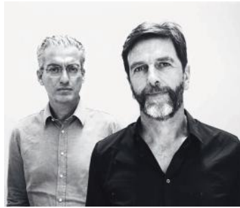
park associati p.418 parkassociati.com info@parkassociati.com