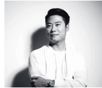
spacemen p.218 spacemen-studio.com explore@spacemen-studio.com