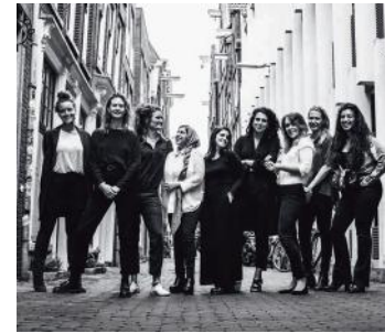
studio modijefsky p.032 studiomodijefsky.com mail@studiomodijefsky.nl