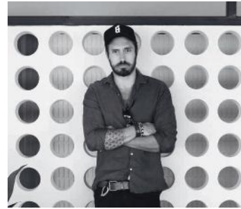
prototyp& p.434 prototypesp.com.br contato@prototypesp.com.br