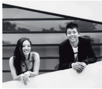
openuu p.238 openuu.com hello@openuu.com