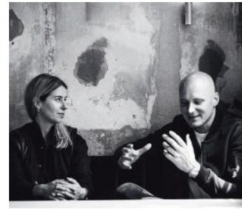
studio riebenbauer p.186 riebenbauer.net gutentag@riebenbauer.net