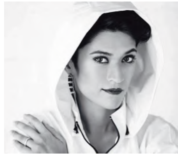
roar p.268, 324 designbyroar.com contact@pallavidean.com