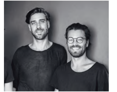
studio knack p.198 studio-knack.de post@studio-knack.de