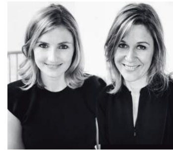
studio tate p.288 studiotate.com.au info@studiotate.com.au