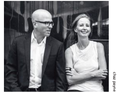
studio unltd p.130 studiounltd.com info@studiounltd.com