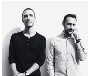
quarta & armando p.164 qaadr.com info@qaadr.com