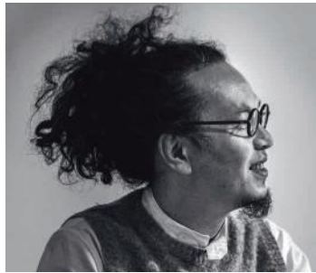
schemata architects p.014 schemata.jp info@tag.schemata.jp