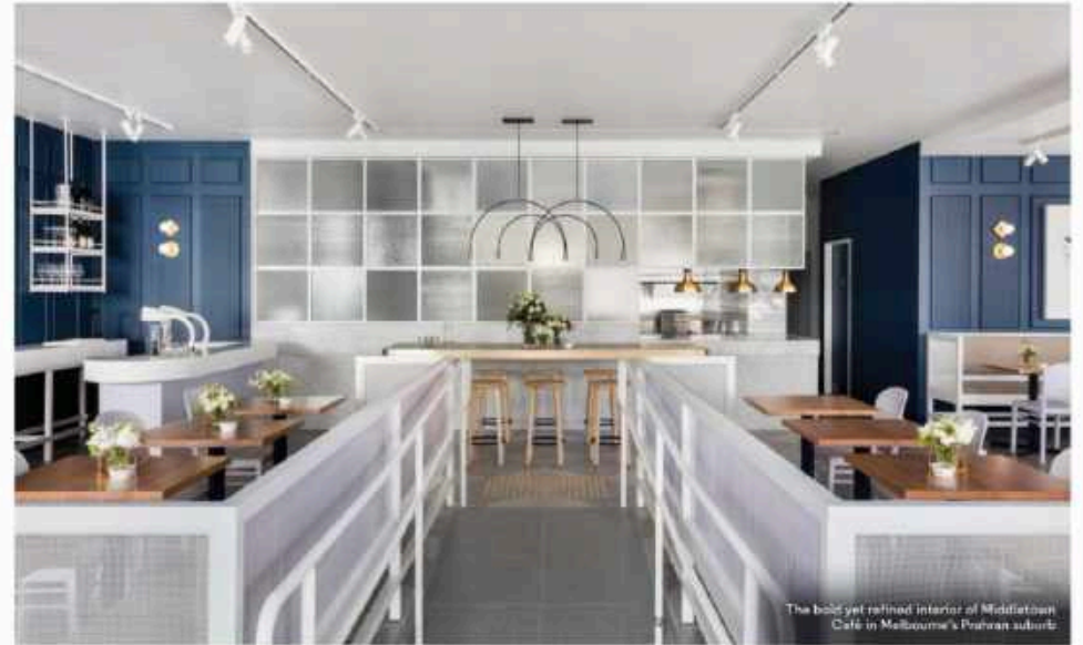
The bold yet refined interior of Middletown Café in Melbourne's Prahran suburb.