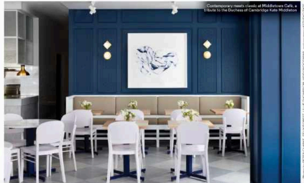
Contemporary meets classic at Middletown Café, a tribute to the Duchess of Cambridge Kate Middleton