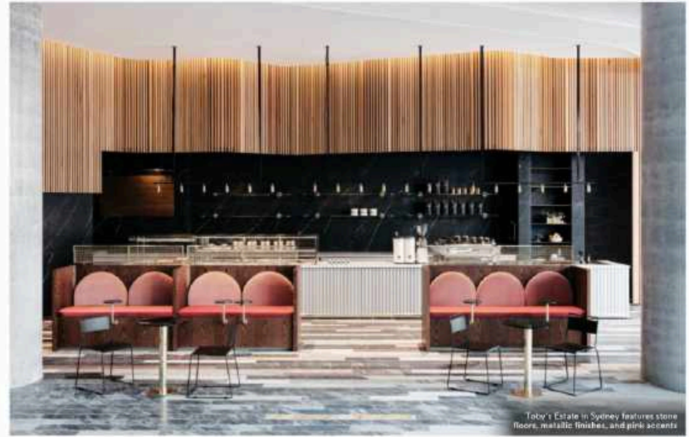
Toby's Estate in Sydney features stone floors, metallic finishes, and pink accents.