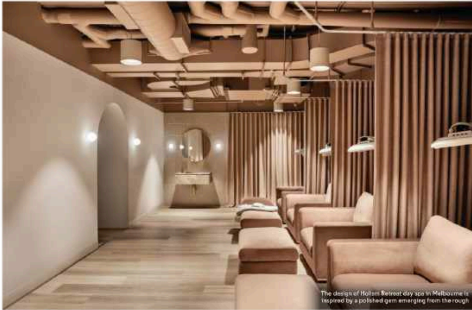
The design of Holism Retreat day spa in Melbourne is inspired by a polished gem emerging from the rough.