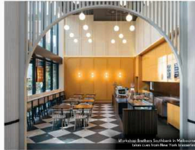
Workshop Brothers Southbank in Melbourne takes cues from New York brasseries.

the process—to have fun, be challenged, excited, and inspired. We love injecting an element of surprise, juxtaposing textures, or including an unexpected color.”