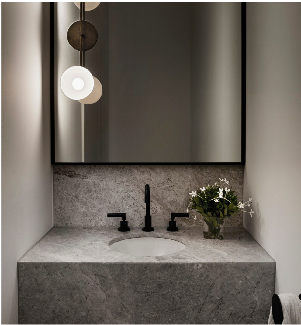
Apparatus trapeze wall light from ECC