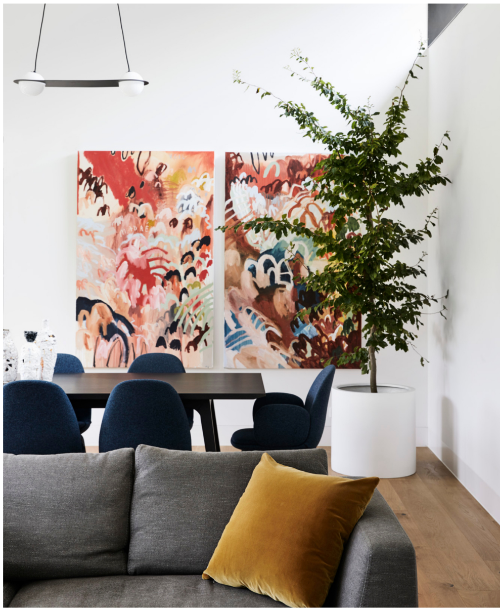
Lambert & Fils Laurent pendant from Backhouse , B&B Italia Charles sofa from Matisse