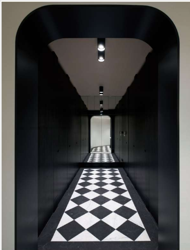
Photography: Thomas Brooke Photography .