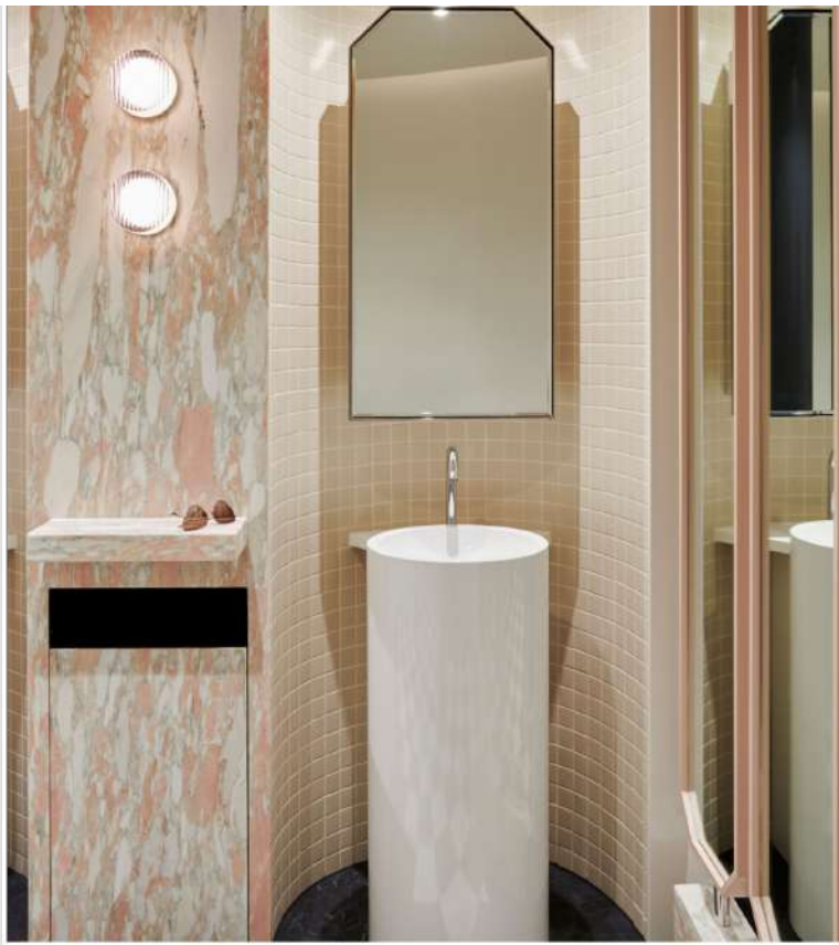
The studio is also behind the recent Holism Retreat is located on the mezzanine level of the new MGallery by Sofitel Hotel Chadstone . The 5-star 250-room hotel was unveiled late last year in an effort capitalise on the 23 million annual visitors to the Chadstone shopping centre.