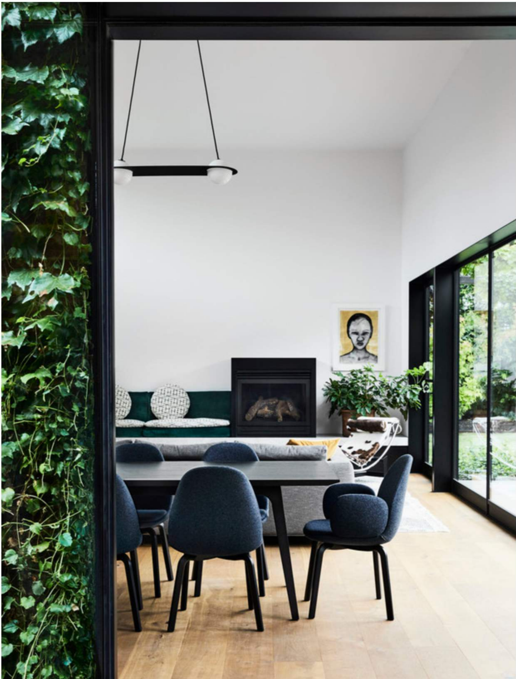
There is a sense of fluidity between all areas of this Australian home.

The goal was to introduce more sophistication, a timeless palette, and reorganize the spaces to allow the family to easily evolve over the years.