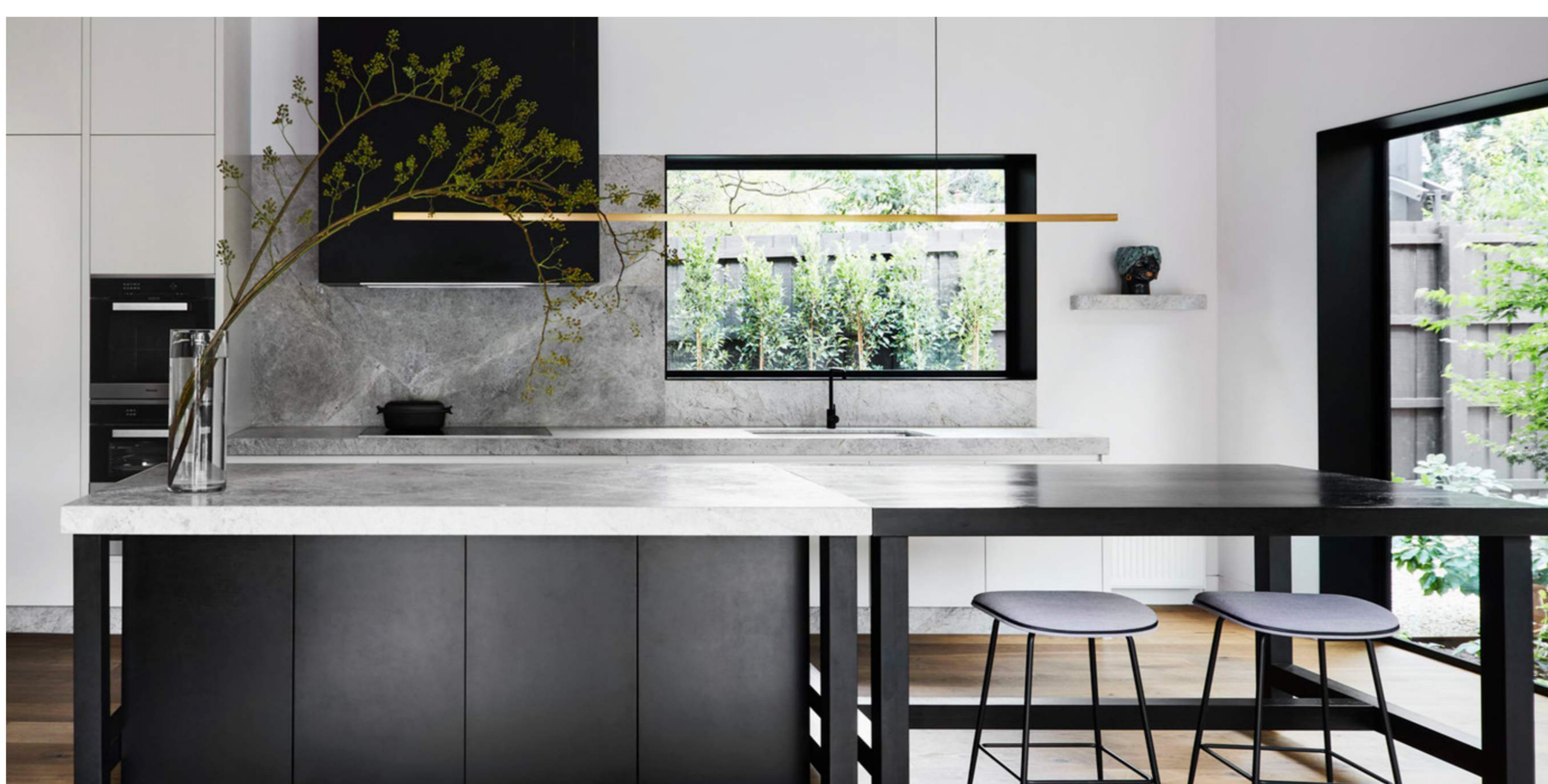
With its refined lines and neutral colors, the kitchen is characterized by its very elegant and minimalist aesthetic. Sharyn cairns