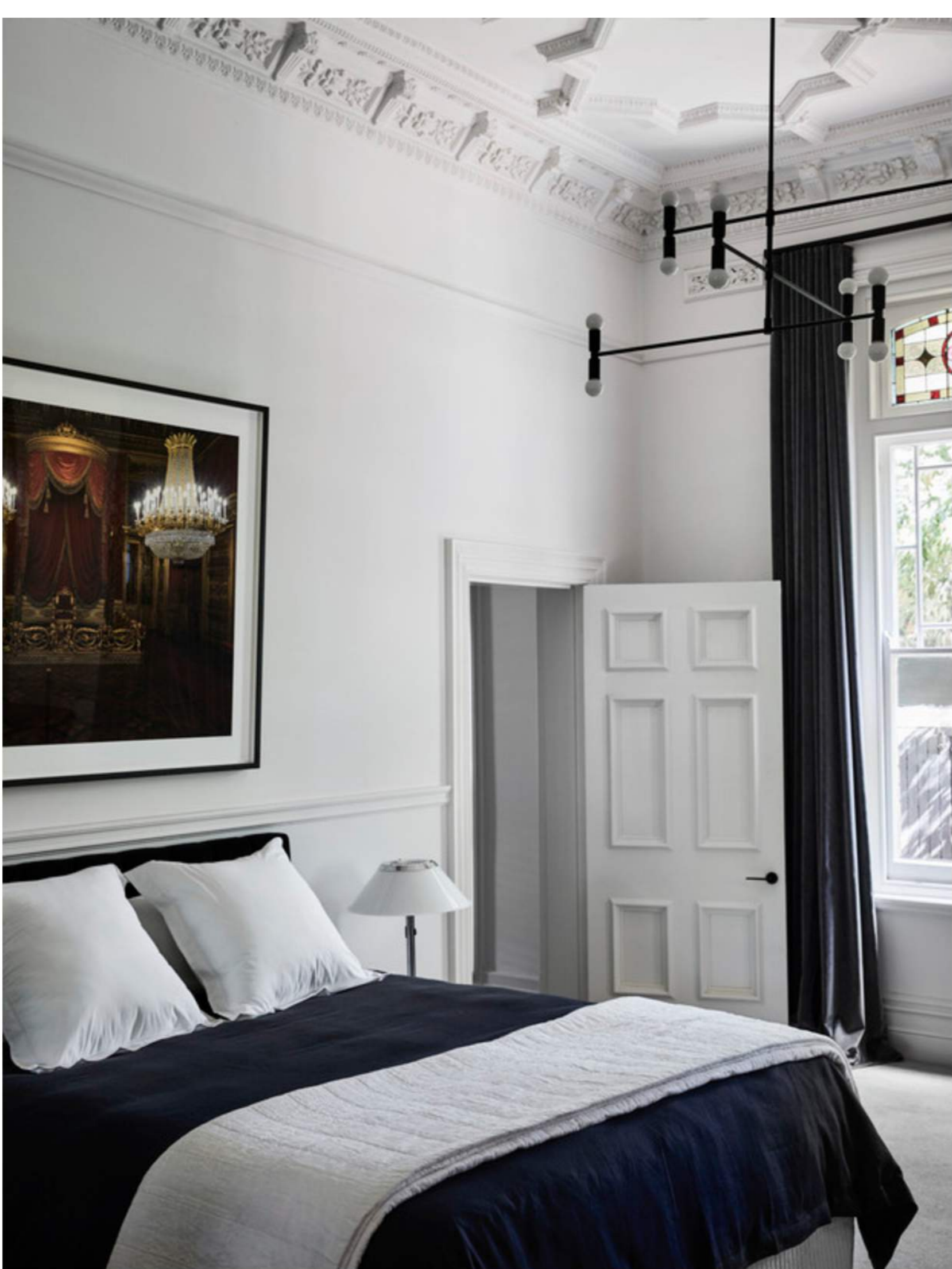
Warm, calm and elegant, this family home highlights the best of its past and combines it with modern pieces. Sharyn cairns

Members of Studio Tate wanted to subtly highlight the history of the place and its important legacy. The moldings dating back to the Victorian period and parquet flooring give a formal feel while the contemporary artwork injects vivid colorful touches and playfulness, balancing out the monochrome palette.