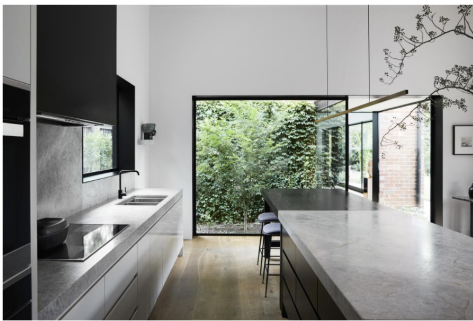
Armadale Residence II - Shortlisted in the IDEA Awards 2020

In this project, a stately heritage home was refreshed by a renovation that was responsive to its owners' current needs as a family. The reconfiguration is reflective of the need for designated spaces that effortlessly transition through cohesive design.